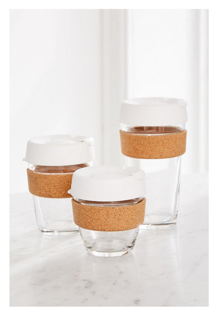
THERE'S SOMETHING INCREDIBLY PLEASING ABOUT THE GLASS CONSTRUCTION OF THIS TRAVEL MUG. FAR MORE ELEGANT, IT COMES IN THREE SIZES (THE LITTLE ONE IS SO CUTE—PERFECT FOR ESPRESSO OR CUBAN COFFEE)